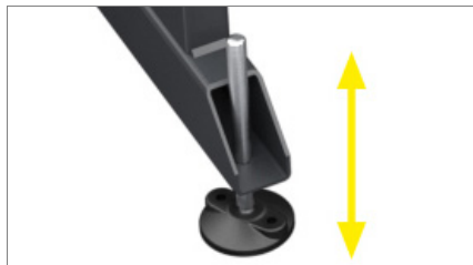
Adjustable feet 01