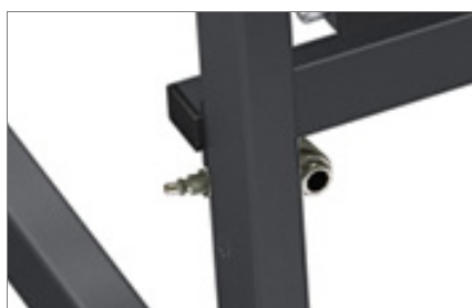
Extendable contact surface 05