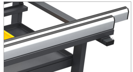
Anti-slip PVC contact surface 02