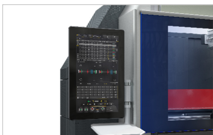
Dynamic double operation 05