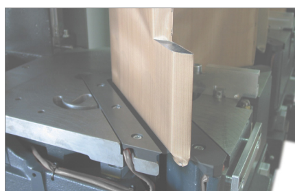
Ergonomic design and safety 05