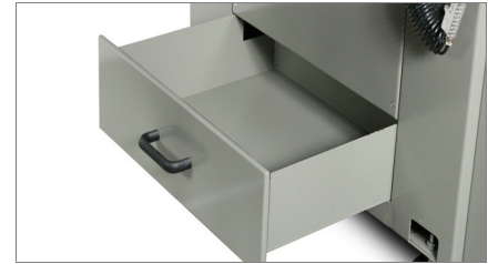
Swarf drawer 02