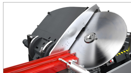
Radial cut 02