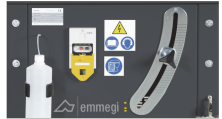
Graduated scale 02