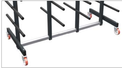
Swivelling castors 01