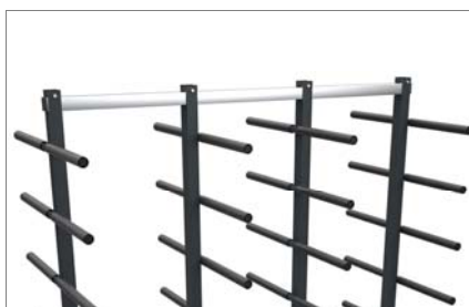
Adjustable central mounts 03

The images are only given for illustrative purposes