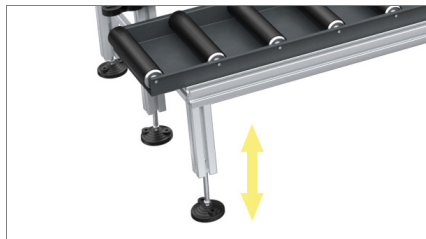
Adjustable feet 01