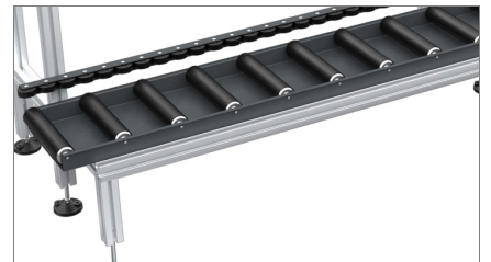
Roller conveyor 02