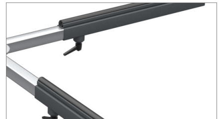
Anti-slip PVC contact surface 02