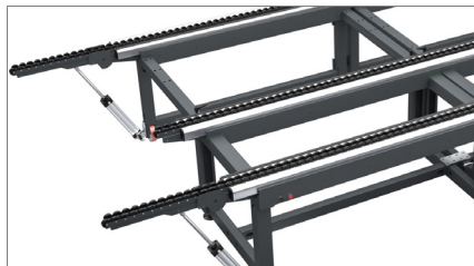
Drop-away roller conveyor 01