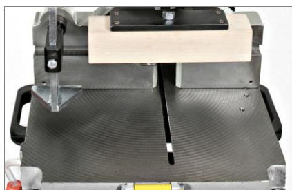
Cutting zone 03

The images are only given for illustrative purposes