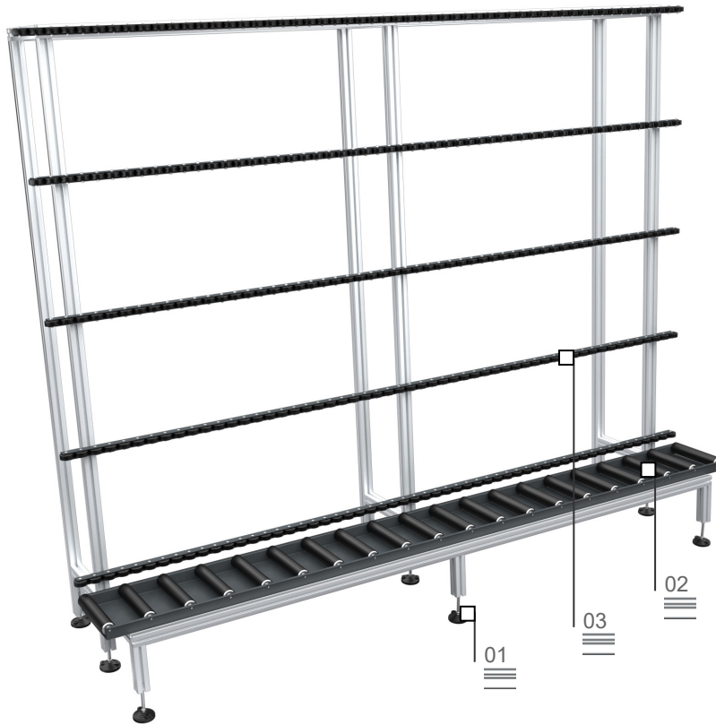
Roller conveyor 02

Vertical roller conveyor for easy transport of frames and fenestration products including very heavy ones between the various assembly stations.