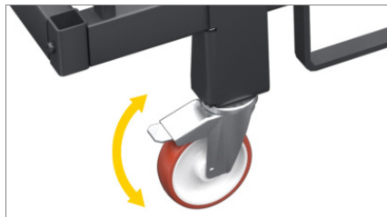
Swivelling castors 01