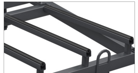
Anti-slip PVC contact surface 02