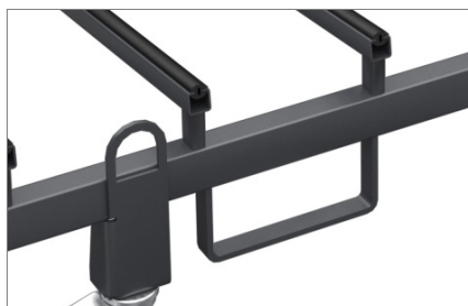
Transporting configuration 04